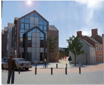
"An idea of what the new Wellington Civic Quarter could look like"