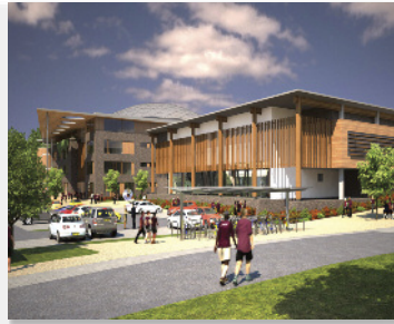
"The new Abraham Darby Sports and Learning Community"